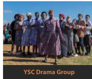
YSC Drama Group

All groups run independently in the schools but receive support from an experienced coach. The groups aim at raising awareness on school safety related topics, e.g. through public performances or debates.