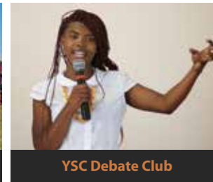
YSC Debate Club

Currently, learners at 18 schools have started school projects: