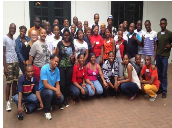
The #EKSE Team at the Kick-Off Workshop

This video ( http://youtu.be/jlvxiZh0Bsc ) is a snap-shot to provide better insight into the initiative.