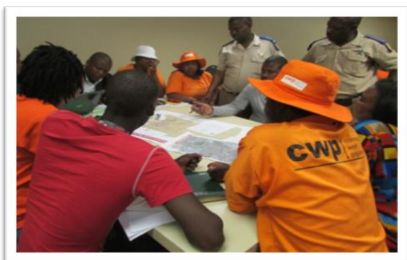
(CWP Systemic Violence Prevention Workshop, Randfontein)

In Randfontein and Kagiso, CWP Multistakeholder Workshops on systemic violence prevention have been conducted with relevant local stakeholders (SAPS, Youth Desk, NGOs, CWP, Municipal Departments) including key provincial departments. This led to improved communication, mutual understanding of the interventions of the various stakeholders and the joint collaboration.