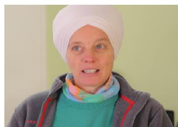
Judy Connor Youth Mentorship Programme Phaphama Initiative