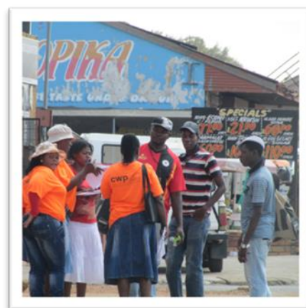
(CWP Safety Audit, Kagiso)

In addition a Geographical Information System (GIS) was utilized to collect CWP and safety data for visualized CWP and Municipality activity planning. 6 CWP participants were trained on how to utilize GPS devices to capture relevant information related to CWP and safety. Furthermore CWP safety perception audits were jointly conducted in partnership with SAPS, Youth Desk, CPF and Municipality whereby over 200 community members were engaged clarifying perceptions and experiences relating to safety and enquiring what changes they would like to see within their own communities.