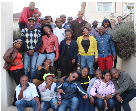
Agents of change: participants of the #EKSE! My Voice, My Safety New Media Communication training.