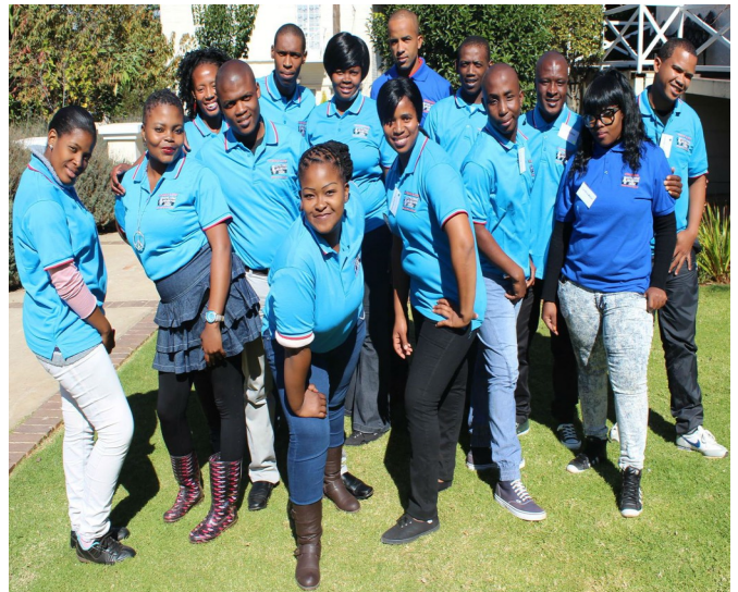
Moving up: Members of the Katlehong Cluster YCPD reached new heights on their Facebook page as they went from 30 to 111

Youth desk members also posted a photo of themselves